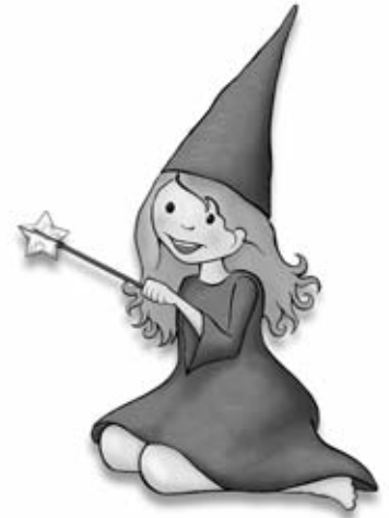
Illustration: Claudia Wiczorek